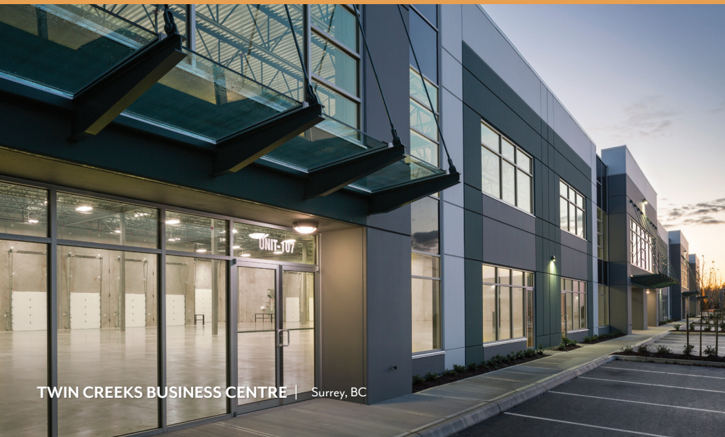
TWIN CREEKS BUSINESS CENTRE | Surrey, BC

By purchasing a brand new building, you minimize your businesses exposure to large capital repairs / replacements for the first 15 years of ownership.