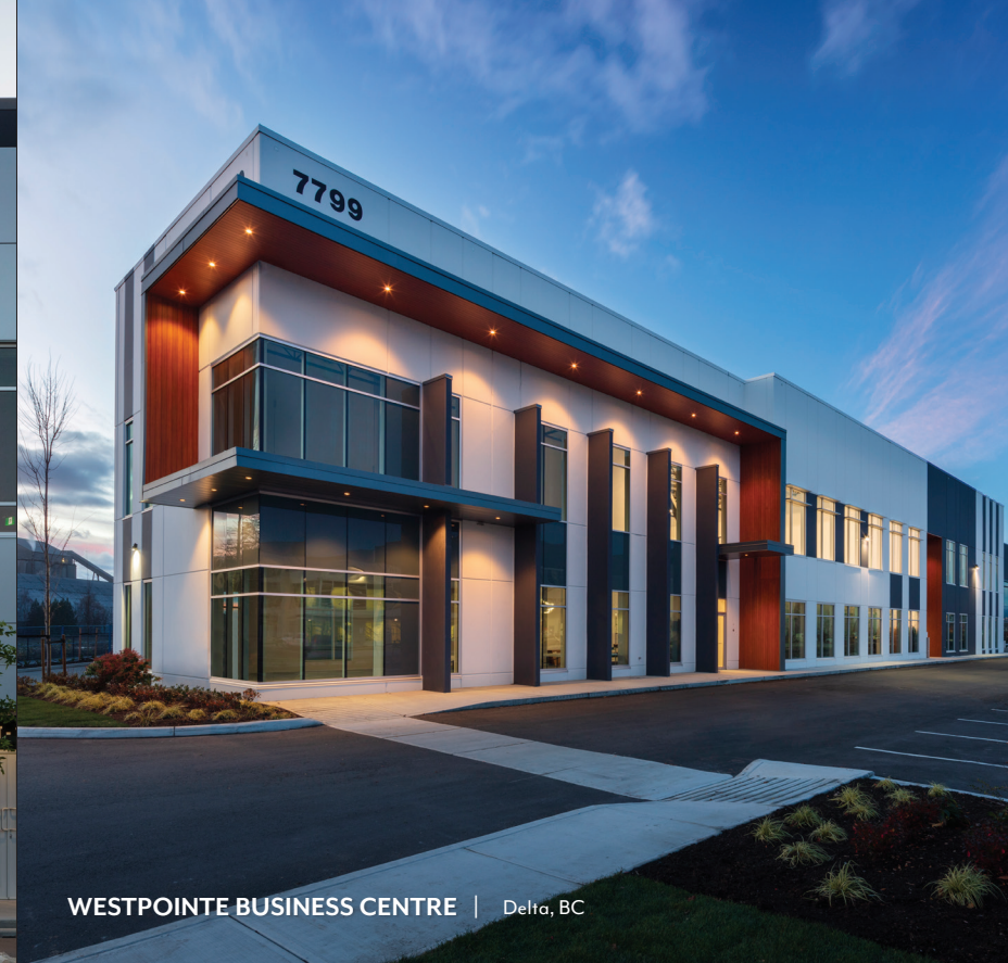
WESTPOINTE BUSINESS CENTRE | Delta, BC