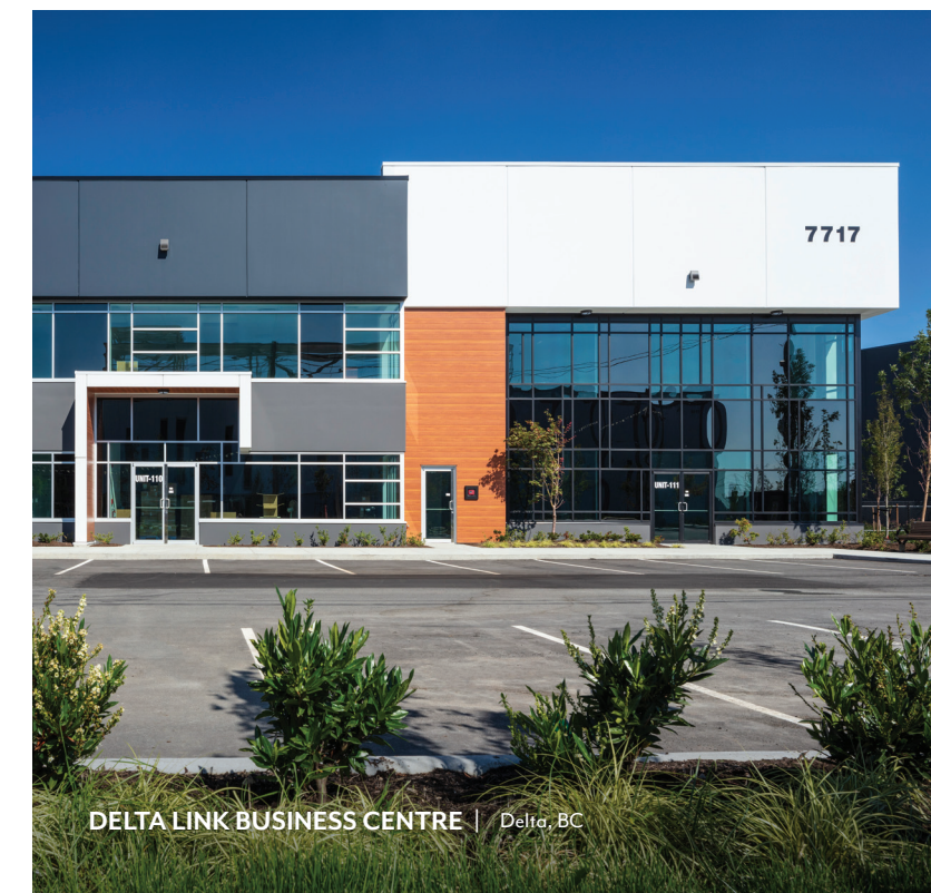
DELTA LINK BUSINESS CENTRE | Delta, BC

Over the past decade, Beedie has worked with local businesses and watched them grow – from being tenants, to purchasing their first condo unit, to owning multiple condo units and eventually, developing custom built-to-suit facilities.